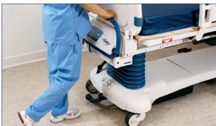
Optional Zoom® drive system minimizes the effort needed for patient transport while encouraging proper ergonomic posture.

The complexity and rising expense of treating critical patients necessitates a practical solution to providing quality care while driving down associated costs. To help address this challenge, Stryker designed a critical care platform that intuitively and efficiently facilitates and complements clinicians' care for their patients.