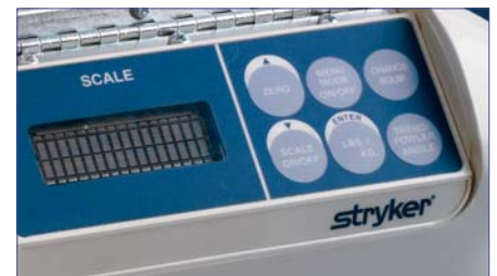
In-bed scale provides accurate, repeatable patient weights with the touch of a button.