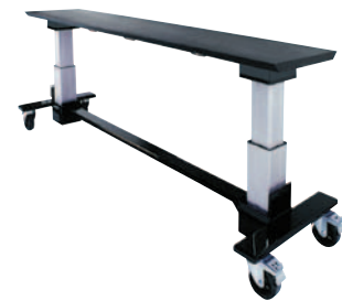
SurgiGraphic® 1027 Image Guided Surgical Table