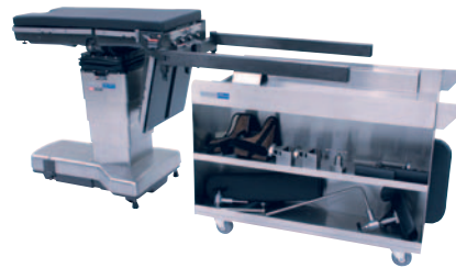
Amsco® 3085 SP Surgical Table and Orthopedic Extension