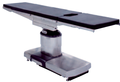
Cmax™ Surgical Table