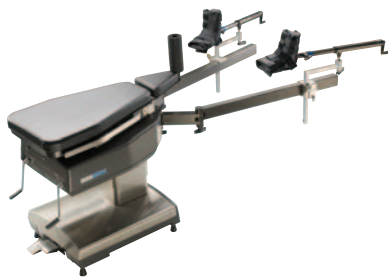
Amsco® OrthoVision® Surgical Table