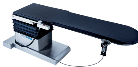
SurgiGraphic® 6000 Image Guided Surgical Table